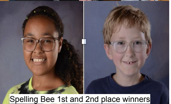
Spelling Bee 1st and 2nd place winners